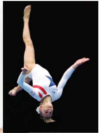
se/Photo By Kimimasa Mayama REUTERS

At age 14 Dominique Moceanu became a 1996 Olympic Champion. She is recognized as the youngest U.S. National Champion in the history of the sport.